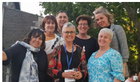
Above: Biennial State Conference Gala Dinner – another great night. Top right: Delegates relaxing at the Gala Dinner.